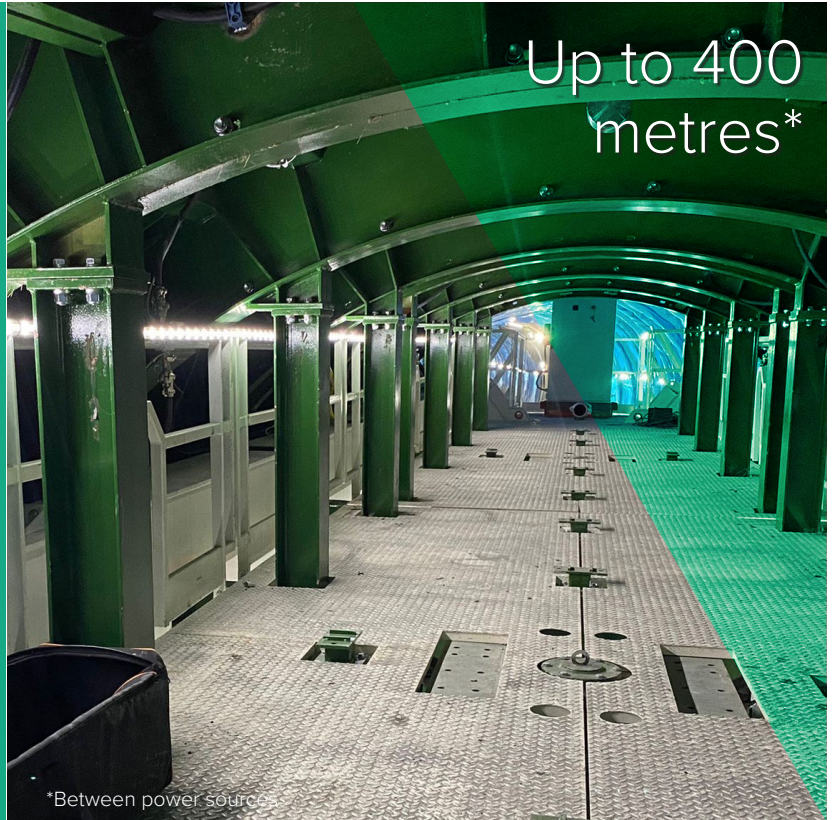
*Between power sources