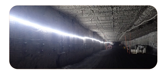
Image: The extra thick copper backbone of the Long Range, x-Glo solution delivers continuous run lengths of up to 168 metres. LEARN MORE

The x-Glo 60-36LR LED Strip Lighting delivers daylight (6500k) white light that provides a 180-degree of lighting, removing dark spots and shadowing where the teams are working. This creates a safer and more productive environment for the underground team.